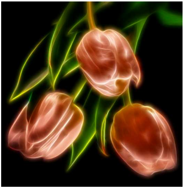
"Fractal Tulips" by Debi Boucher