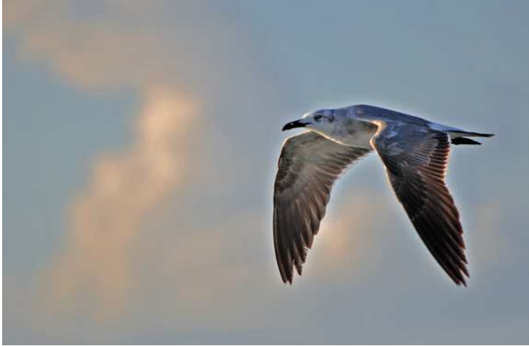
"Morning Gull" by Jerry Moldenhauer